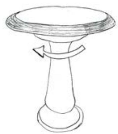
Exaco Trading<sup>TM</sup> Co.

2. With the BASE/PEDESTAL on a flat surface, twist the BASIN into the PEDESTAL until snug (do not over tighten).